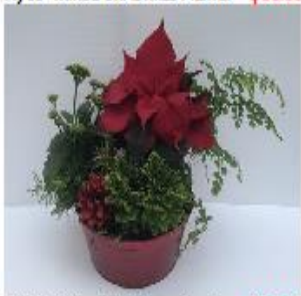
O) 13" Mixed Christmas Planter - $35.00 P) 4" Christmas cactus with pot cover - $6.00