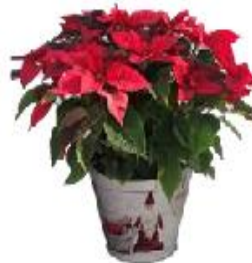
K) 10" Poinsettia Red with metal cover - $35.00

Brought to you by: Hilltop Greenhouses Ltd. Victoria, BC www.HilltopGreenhouses.com