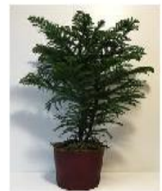
U) 8" Norfolk Pine with plastic cover - $35.00