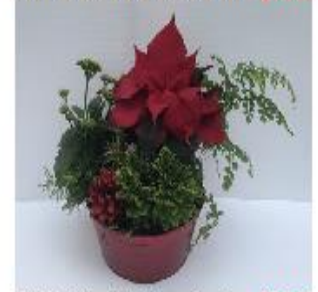
O) 13" Mixed Christmas Planter - $35.00